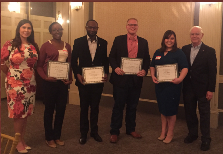
MPA students at the Centex chapter awards