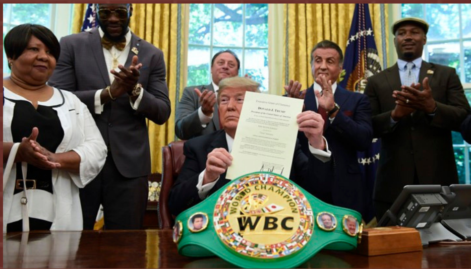
President Trump issues a pardon for the late boxing champion, Jack Johnson.