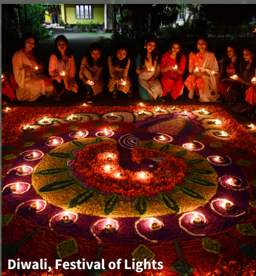
Diwali, Festival of Lights