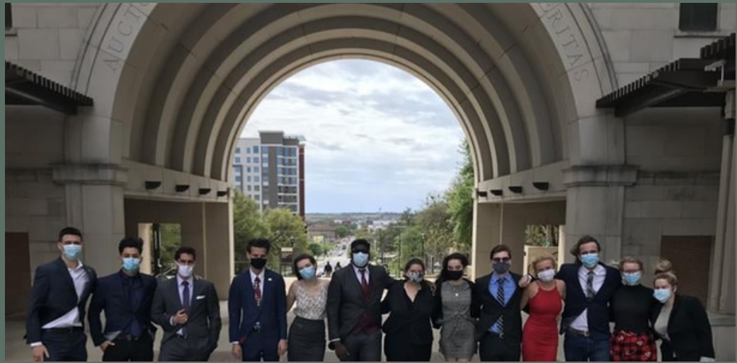
Model United Nations students