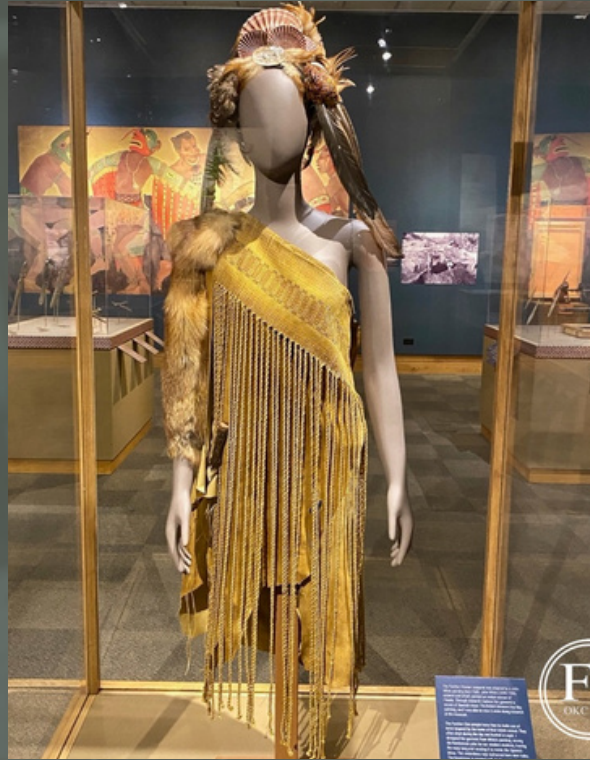
From the Spiro Mounds exhibit