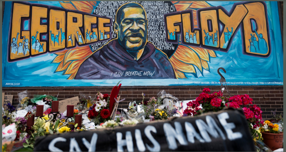
Memorial for George Floyd in Minneapolis, MN